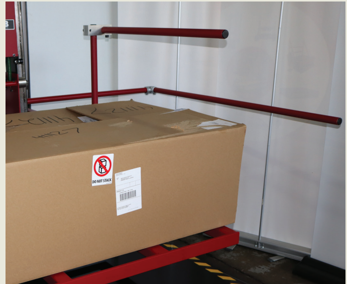
Extended Support Tines