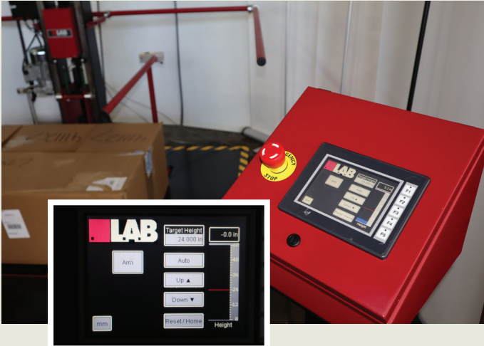
Intuitive and Operator Safe multi-position control station