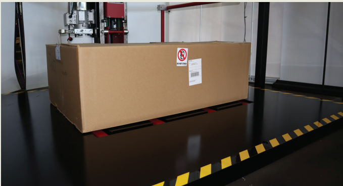
Expanded Base Plate for larger test items